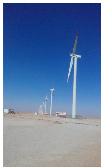
Fig. 4 wind farm 10 MW installed in Kaberten (Adrar)