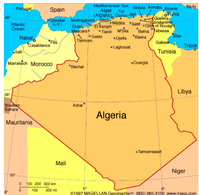
Fig.1. Algeria map [4].

East by Tunisia and Libya, to the west by Morocco, Western Sahara, and Mauritania [3], as presented in Figure 1.