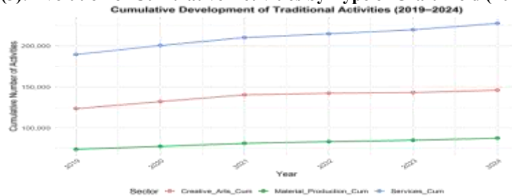
Figure (3): Evolution of Cumulative Activities by Type of Craft Field (2019–2024)

Figure 3 illustrates the cumulative growth in activities over the period 2019–2024, offering a comprehensive view of long-term sectoral expansion. While cumulative curves emphasize overall progress, they may conceal short-term disruptions or accelerations, which are better observed through the year-on-year breakdown shown in Figure 2. Taken together, these plots contribute to a clearer understanding of the evolution and internal rhythms of Algeria’s traditional industries.