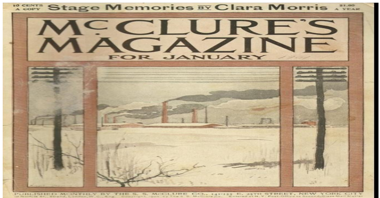
Figure 2.2 McClure's magazine cover for January 1901 published many early muckraker articles ( Wikipedia, 2022).