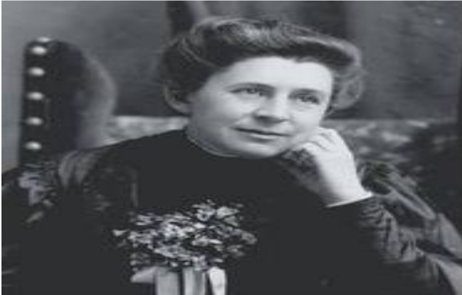
Figure 2.1 A Portrait of Ida Tarbell (Brady, 1989).

In Pennsylvania, at the onset of the oil boom, Ida Tarbell was born on November 5, 1857, and died on January 6, 1944. She was an American writer, investigative journalist, biographer, and lecturer. She was one of the leading muckrakers of the Progressive Era from the late 19th to the early 20th centuries and pioneered investigative journalism (The Biography, 2021).