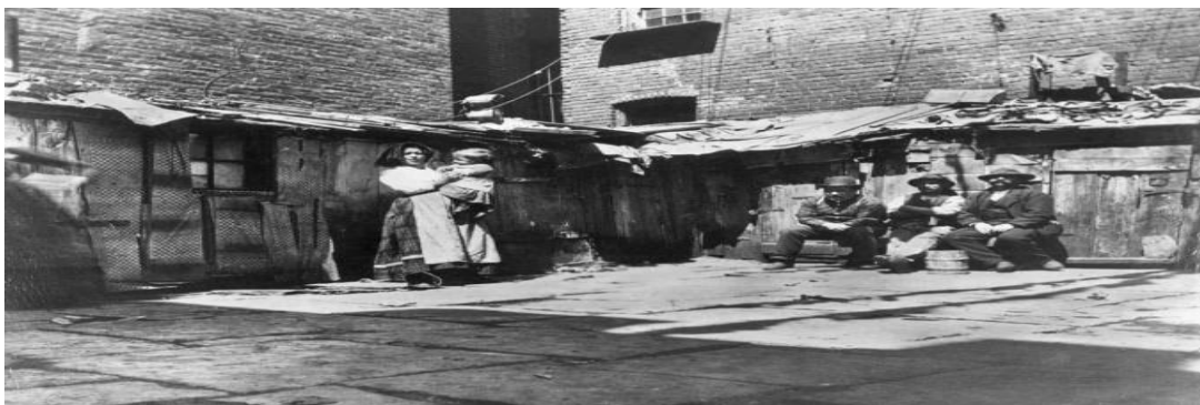
Figure 1.2 Jacob Riis photograph describe immigrants situation during the progressive era (Riis, 1890).