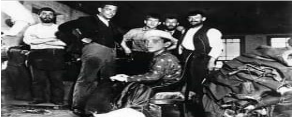
Figure 1.1 Jacob Riis photograph describe children labour during the progressive era (Riis, 1890).

As the industry grew following the Civil War, children often labored as young as ten years old and sometimes much younger. They worked in industrial settings and retail stores, on the streets, on farms, and home-based industries.