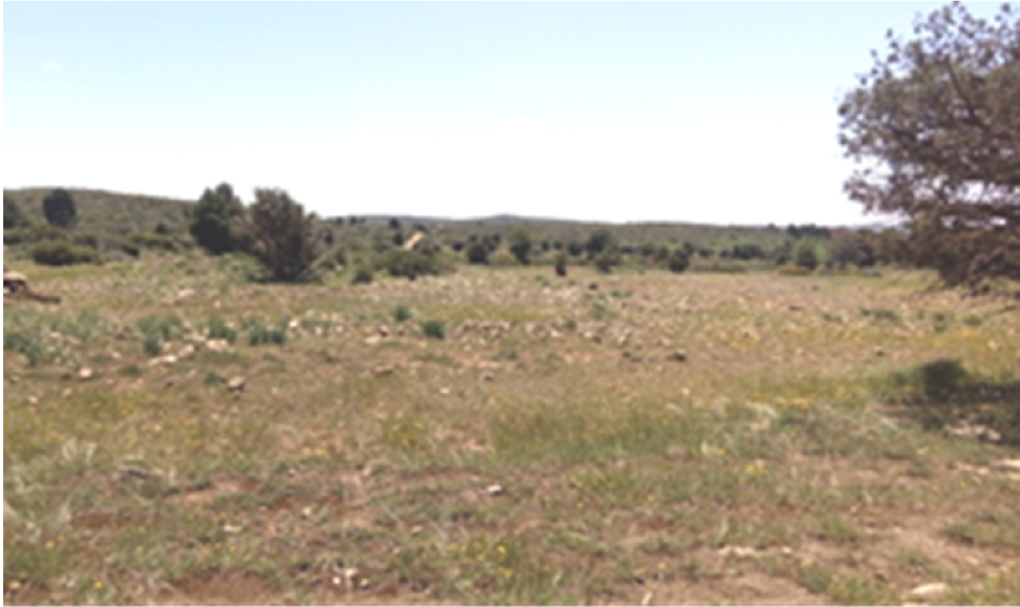
Figure 3: Natural Habitat of Psammodromus blanci typical steppe formations Sidi Bel Abbes region.

The consequences of climate change, are the isolation on the reliefs of the massif of species with more humid requirements, such as Coronella girondica , Chalcides mertensi and Psammodromus blanci [25].