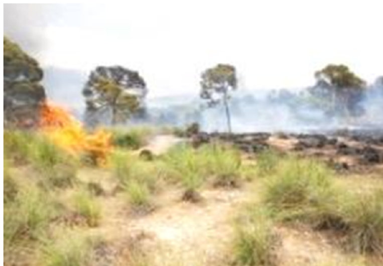
Figure 6: Forest fire in Merine, Sidi Bel Abbes region (2016)

Every year, during the summer, fires attack thousands of hectares of forests in Merine, Sidi Bel Abbes region (fig 4).