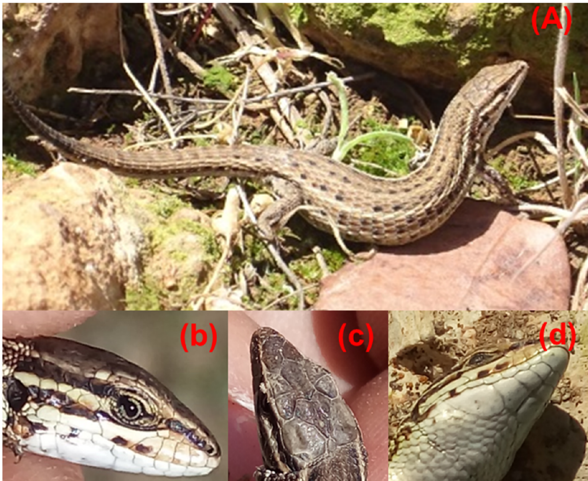
Fig 2. Photographs of Psammodromus blanci (a) General view in natural Habitat; (b) lateral; (c) dorsal; (d) ventral view of the head

The new locality of Laghout (Aflou) is characterized by vegetation varies from afforested and scrub areas present in the Saharan Atlas relief, with steppe vegetation found [23,24]. Where, many authors mentioned its affinity to steppe formations and it can inhabit the plain covered with thyme ( Thymus vulgaris L.), Mediterranean dwarf palm ( Chamaerops humilis L.), Spart ( Lygeum spartum Loefl.) or Alfa ( Stipa tenacissima L.) [4,20].