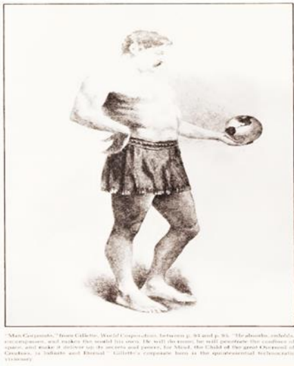
Figure 2.2.2. Party Polarization in Congress 1879 – 2009

In the article "From Cyber-Utopia to Cyber-War: Normative Change in Cyberspace" on pages 86–88, Matthias Schulze (2018) suggests that technology often fails to align with traditional frameworks in society, highlighting a disagreement on how to address socio-technical challenges, particularly in the American context, where technological divisions are stark. Schulze notes the juxtaposition of techno-utopian ideals and social inquiry within a polarized citizenry, contrasting sharply with alternative perspectives such as technological determinism, actor-network theory, or system theory. According to Schulze, constructionism diverges from other paradigms by viewing technology as both emerging from and causing social changes simultaneously. Proponents of caution emphasize the importance of careful planning during the conception stage and adherence to cultural practices that shape its outcomes, adopting a consequentialist approach. In Schulze's work, it is noted that a significant constructivist outlook emphasizes the relationship between technological design, power relations, and societal