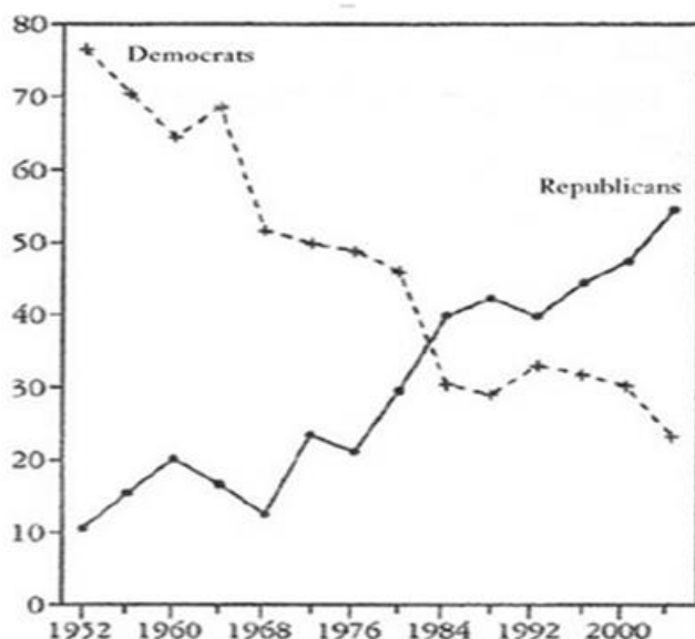
Figure 1.7.3. Party identification of white voters in southern US from 1952 to 2004

In this revealing image, the shifting party identification trends among white voters in the southern United States from 1952 to 2004 are graphically illustrated, providing insight into the evolving political landscape of this region over the decades.