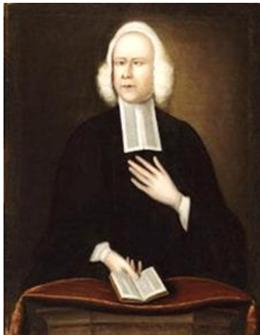
Figure 1.1.2. George whitfield

Whitefield's powerful and charismatic preaching, coupled with Edwards' intellectual defense of religious fervor, fueled the momentum of the Great Awakening. Despite facing criticisms and causing divisions within conservative Presbyterian circles, figures like Tennent played crucial roles in propagating the revival's message of spiritual renewal and personal transformation. George Whitefield, an Anglican evangelist, emerged as a central figure in the 18th-century Protestant revival across Britain and the American colonies. His tireless efforts to spread the message of spiritual rebirth resonated deeply with audiences, contributing significantly to the Great