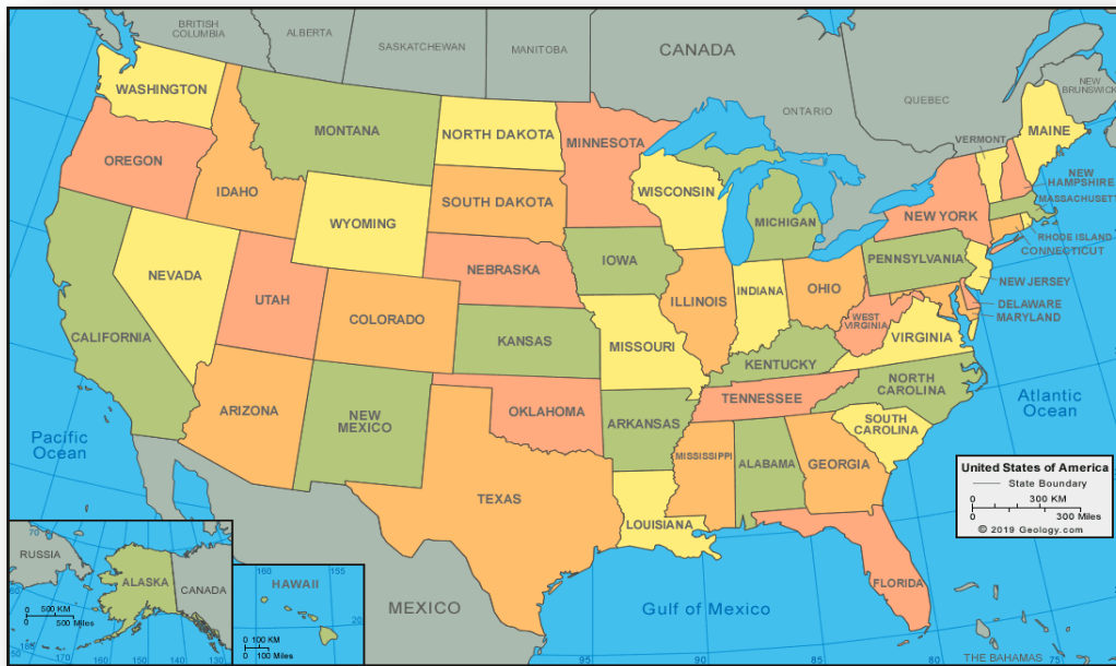
Figure 1.1. United States Map (GIS Geography, 2021)

American citizens' support for foreign policy aid to various countries means that the mass public has a position opinion for making decisions .However, this caused the raising of United States' population, in 2021; the United States number of population is estimated to be 332 million, with a growth rate of 0.8%. The average life expectancy is 82.3 years for females and 77.8 years for males as the last census was conducted in 2020, and the next census will take place in 2030, The United States has joined the global world for the first time, yet its fast expansion since the eighteenth century has been unprecedented (World population, 2021).