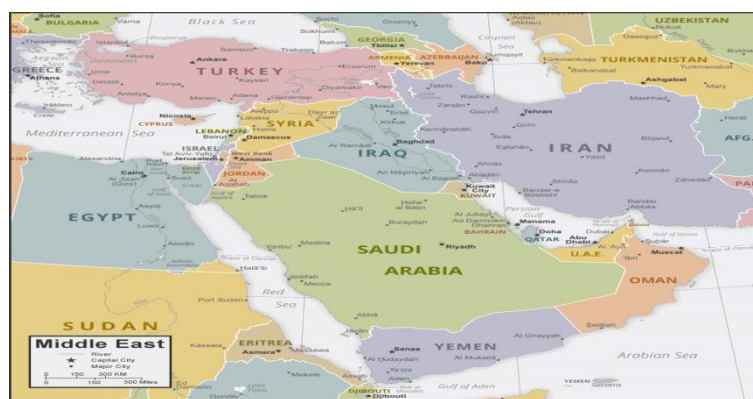
Figure 1.2. The Middle East (Geosciences News and information, 2021).

In terms of geography and nations involved, the Middle East is generally made up of Gulf nations such as Egypt, Lebanon, Syria, Jordan, Israel, the Gaza Strip, the West Bank, Iran, Iraq, Saudi Arabia, Yemen, Oman, and the United Arab Emirates, It encompassed Turkey and North Africa, as well as Qatar and Kuwait. The topography of the Middle East is one of the most important political variables influencing Middle Eastern policy.